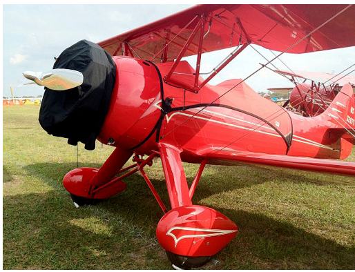
Waco UPF-7 Canopy & Engine Cover