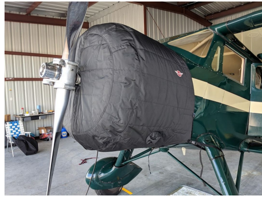
Wacon Cabin Biplane ZQC-6 Insulated Engine Cover