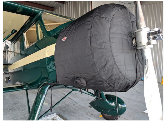
Wacon Cabin Biplane ZQC-6 Insulated Engine Cover