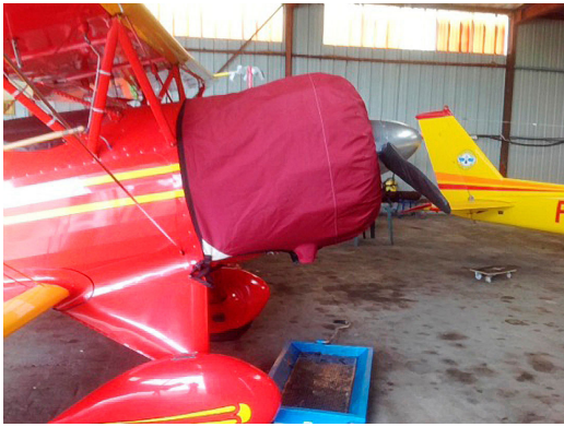
Waco Engine Cover