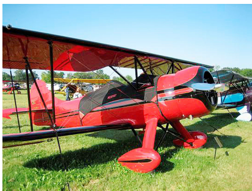
Waco UPF7 Canopy Cover