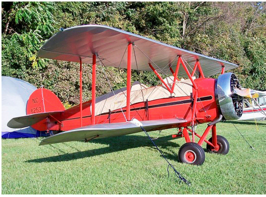
Waco ASO Canopy Cover