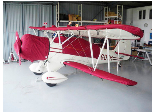
Waco UPF-7 Canopy, Wings, Stab's, Engine, Prop Covers