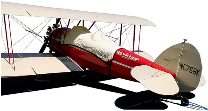
Waco 10 Canopy Cover