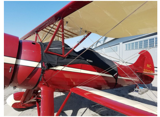
Waco UPF-7 Canopy Cover