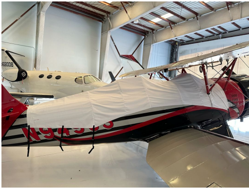
Waco YMF-5 Canopy with Turtledeck Extension, test fit cover