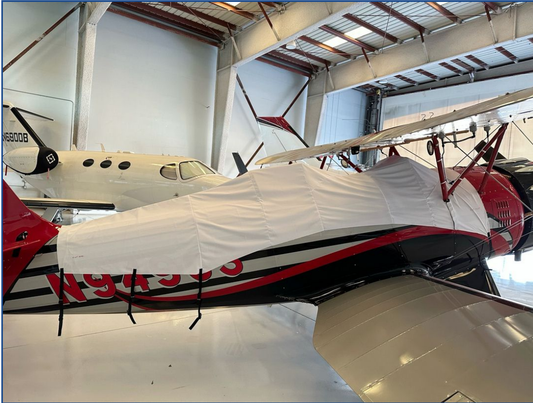
Waco YMF-5 Canopy with Turtledeck Extension, test fit cover