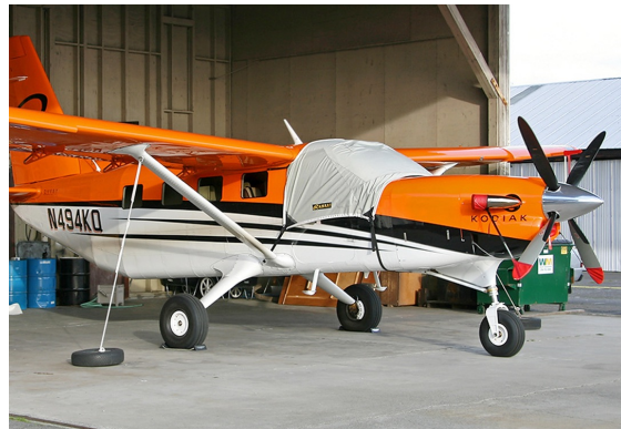
Waco UPF-7 Horizontal Stab. Cover Quest Kodiak Windshield Cover, Prop Tie/Exhaust Covers, Engine Inlet Plugs & Pitot Cover