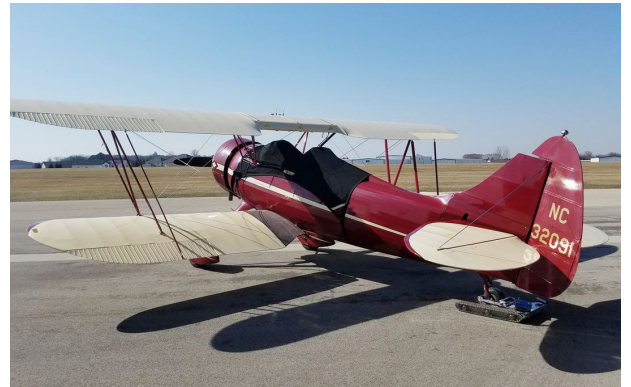
Waco UPF-7 Canopy Cover