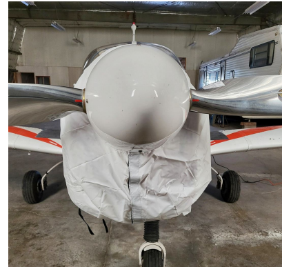
Zlin 142C Engine Cover, test fit cover