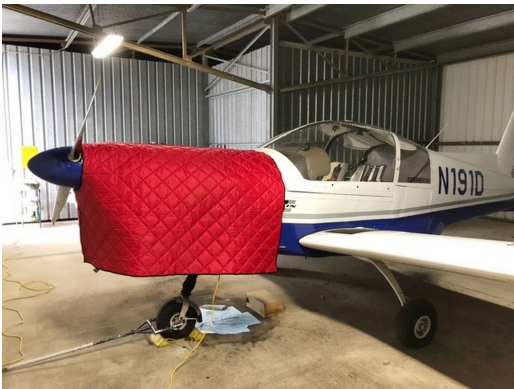
Zlin 142 Insulated Hangar Blanket