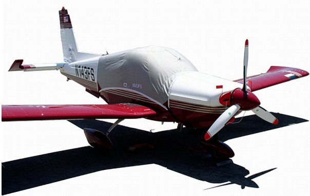
Zlin 143 Canopy Cover and Engine Plugs

This cover type is made from Silver Acrylic Sunbrella canvas and is 100% lined with a soft and smooth microfiber. Bruce's Custom Covers developed this material combination especially for aircraft protection. The outer material is medium weight and treated for water resistance, UV resistance and anti-static buildup. The inner lining is a very soft and smooth microfiber to prevent scratching. The material is very reflective, and tests show that the cabin interior temperature can be reduced to near-ambient temperature on the hottest of days. It is water, ice and snow repellent, yet breathable to allow moisture to escape from between the cover and the aircraft surface.