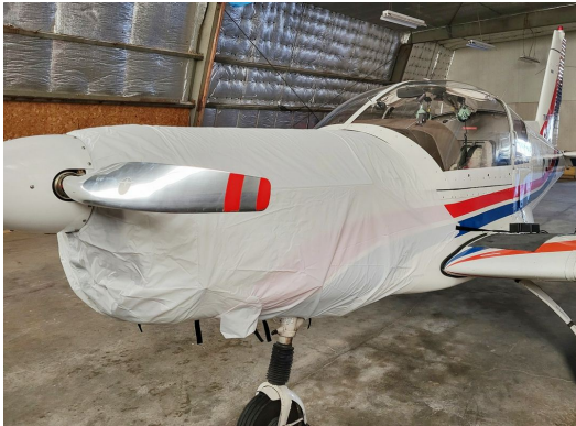
Zlin 142C Engine Cover, test fit cover

This cover type is made from Silver Acrylic Sunbrella canvas and is 100% lined with a soft and smooth microfiber. Bruce's Custom Covers developed this material combination especially for aircraft protection. The outer material is medium weight and treated for water resistance, UV resistance and anti-static buildup. The inner lining is a very soft and smooth microfiber to prevent scratching. The material is very reflective, and tests show that the cabin interior temperature can be reduced to near-ambient temperature on the hottest of days. It is water, ice and snow repellent, yet breathable to allow moisture to escape from between the cover and the aircraft surface.