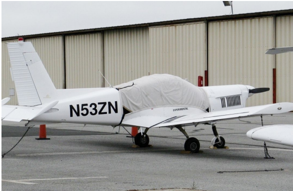
Zlin 142 Canopy Cover

The Zlin 42 Canopy/Engine Cover is a one-piece cover (100% lined with microfiber) that is a combination of the Canopy Cover and Engine Cover. This cover will enclose the engine cowl and will extend aft to cover all of the windows. This cover type is made from Silver Acrylic Sunbrella canvas and is 100% lined with a soft and smooth microfiber. Bruce's Custom Covers developed this material combination especially for aircraft protection. The outer material is medium weight and treated for water resistance, UV resistance and anti-static buildup. The inner lining is a very soft and smooth microfiber to prevent scratching. The material is very reflective, and tests show that the cabin interior temperature can be reduced to near-ambient temperature on the hottest of days. It is water, ice and snow repellent, yet breathable to allow moisture to escape from between the cover and the aircraft surface.