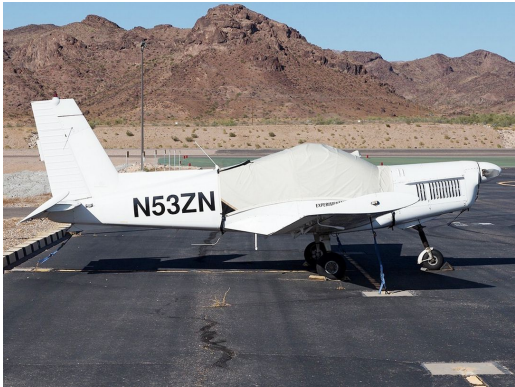
Zlin 142 Canopy Cover