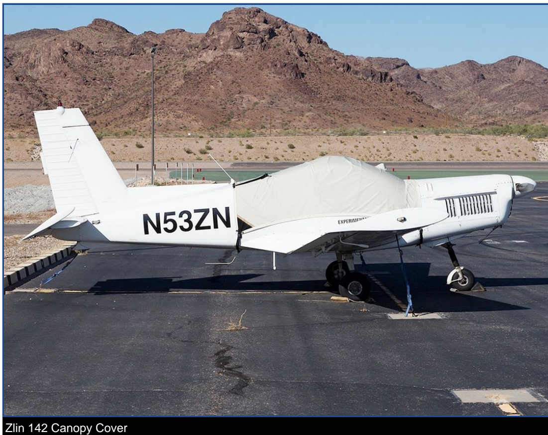
Zlin 142 Canopy Cover