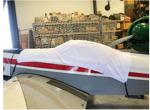
Zlin 526 Canopy Cover, test fit cover