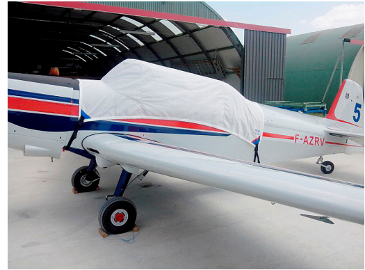
Zlin 526 Canopy Cover