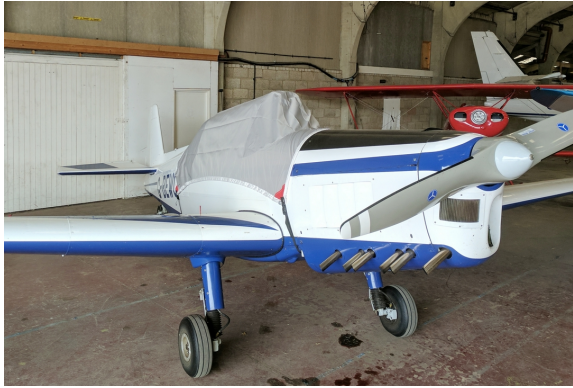
Zlin 326 Travel Cover

Travel Covers are made with Silver Solution-Dyed Polyester fabric and only lined over the windshield to save weight. The material is lightweight and more compact for easy stowage in the aircraft. The polyester material is water resistant, but only intended for occasional use outside. We also have an ultra lightweight material available for fitted hangar dust covers. For daily outdoor use, the non-travel Sunbrella Cover is the best choice.